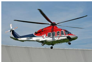
Image of a helicopter

So! Helicopter leads me to Heliconia. I now don't ever forget the Latin term Heliconia .